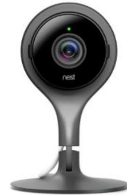
Nest Cam Indoor Plug-in-and-go security.