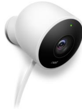
Nest Cam Outdoor Security, rain or shine.