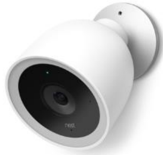
Nest Cam IQ outdoor Mighty. Smart.