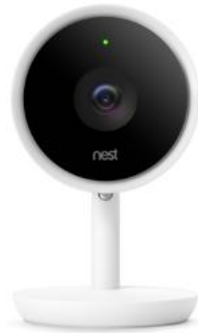
Nest Cam IQ indoor Best-in-class security camera.