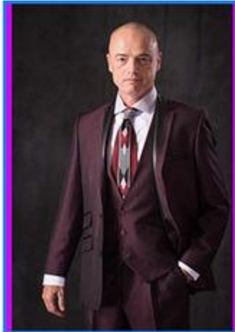
Printed as a 5x7