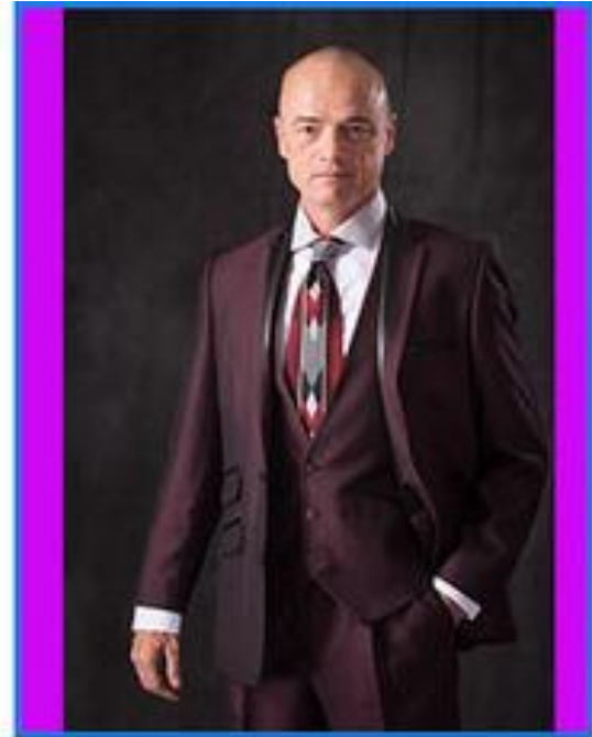
Printed as an 11x14