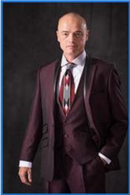
Printed as a 4X6