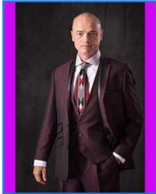
Printed as an 8X10